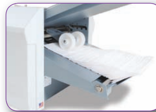
Closed outfeed stacker for tight spaces